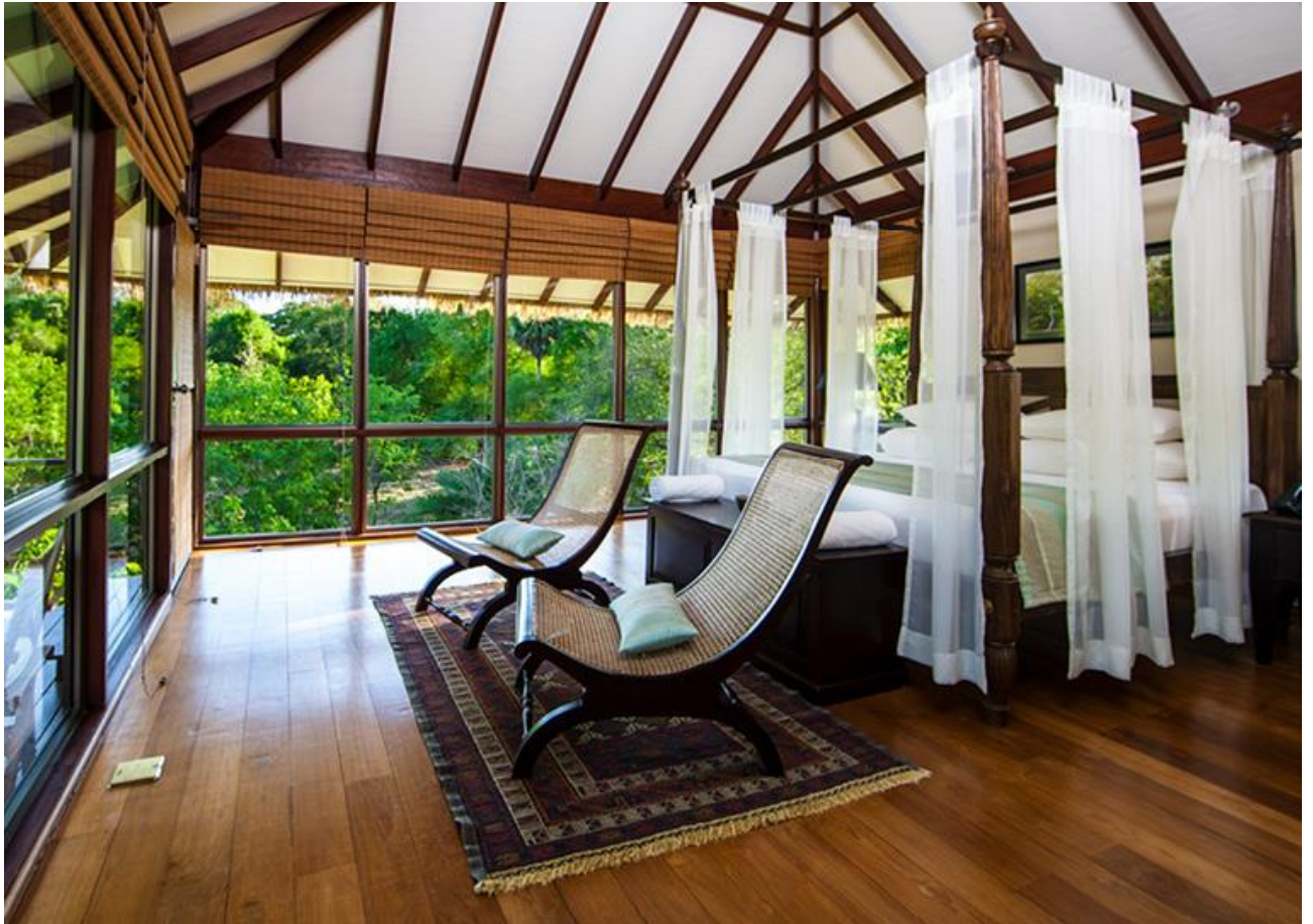
A master bedroom at the Ulagalla Villas

Accommodations in this part of the country include Vil Uyana ($$$$$), an eco-resort whose bungalows dot reclaimed wetlands where you might spy a crocodile lazily wading its way among the reeds. Also nearby, Ulagalla ($$$$$) is a boutique hotel that comprises a 150-year-old mansion and villas set amidst 58 acres of lush gardens. After a day of sightseeing, you can go kayaking alongside local fisherman on the enormous reservoir adjacent to the property.