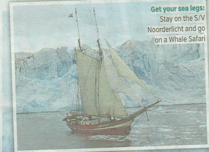
Get your sea legs: Stay on the S/V Noorderlicht and go on a Whale Safari

The Phobjikha Valley is the winter home to swarms of the graceful