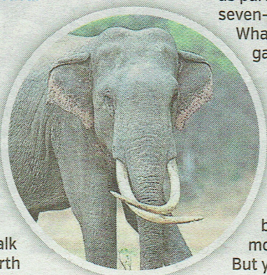
So re elephant: See lots of Asian elephants in Sri Lanka

Returns from London to Delhi from £293, britishairways.com , and from Delhi to Paro from £380, drukair.com