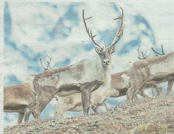
Get out of a rut: Spot caribou during the rutting period in Alaska

Returns from London to Perth from £532, emirates.com/uk