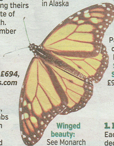
Winged beauty: See Monarch butterflies in California

Returns from London to Vancouver from £340, westjet.com