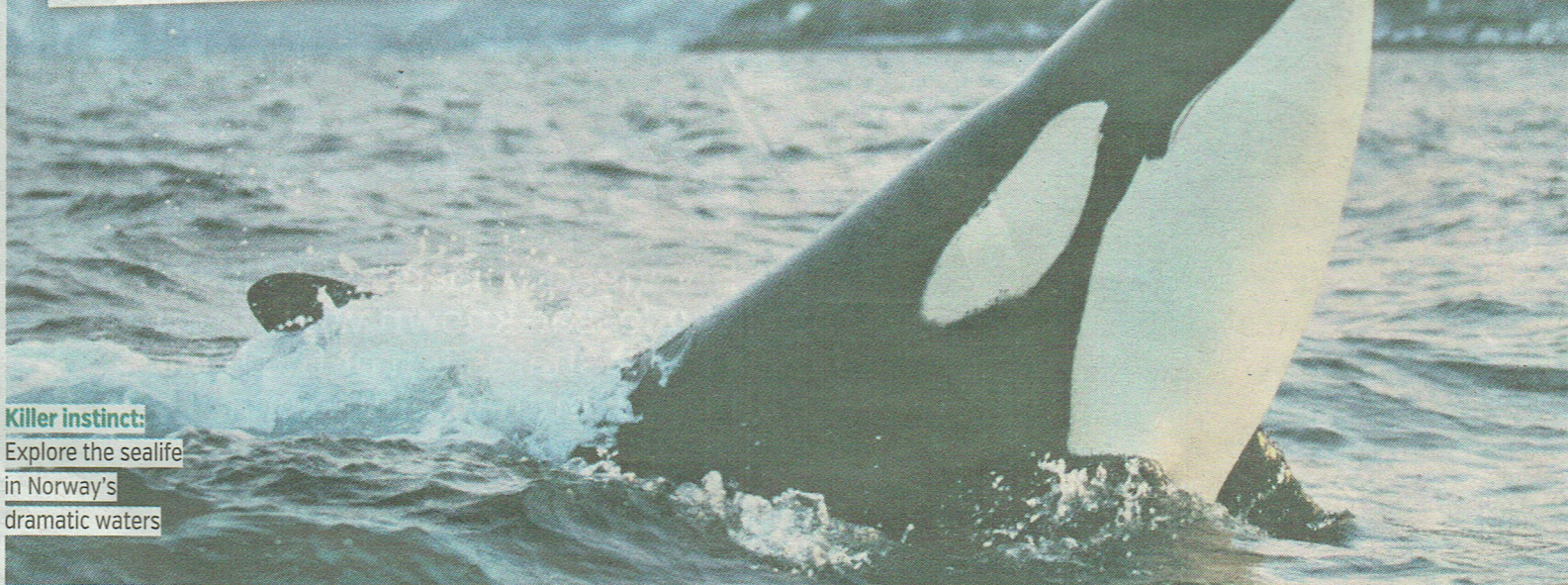
Killer instinct: Explore the sealife in Norway's dramatic waters