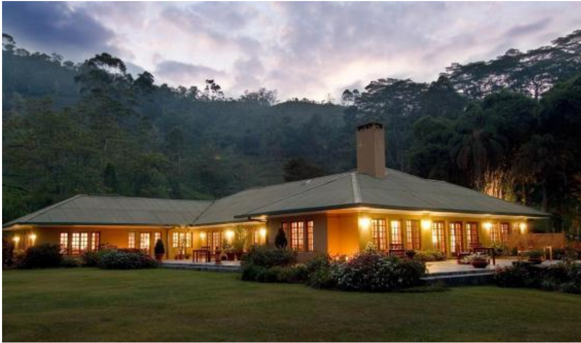
Ceylon Tea Trails (Sansoni Norwood)

Rates from £500/night; resplendentceylon.com