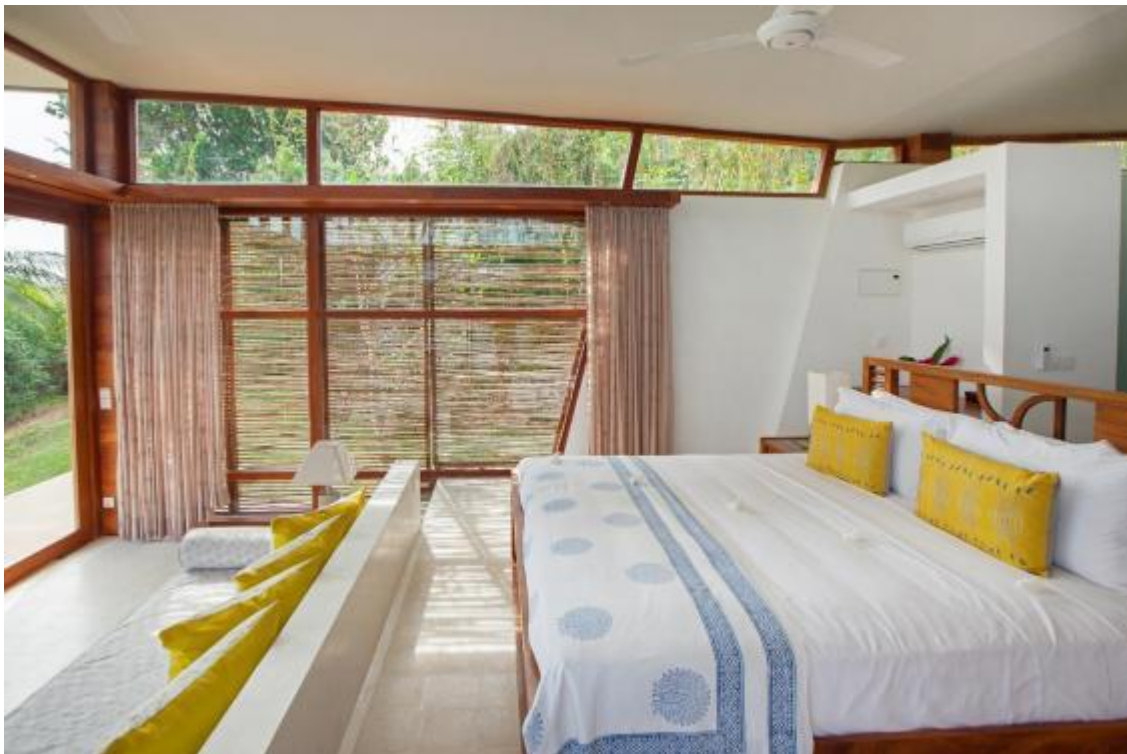
A family villa at Tri

Chances are your first stop south of Colombo is going to be Galle, a historical fort town that's well worth a visit. Your next stop should be Tri, a new, sustainable luxury hotel on Lake Koggala, that's the ultimate spot for a little R&R. A glorious day would be spent simply dipping your toes in the striking infinity pool, though if you want more than that, there's a yoga studio complete with jungle breeze, a well-being library, and a spa with Ayurveda treatments, all set in the most serene of surroundings. Comprised of just 11 contemporary villas and rooms, Tri is wonderfully private; each of the suites are contemporary and comfortable with spacious modern bathrooms, airy balconies with beautiful views, and private pools.