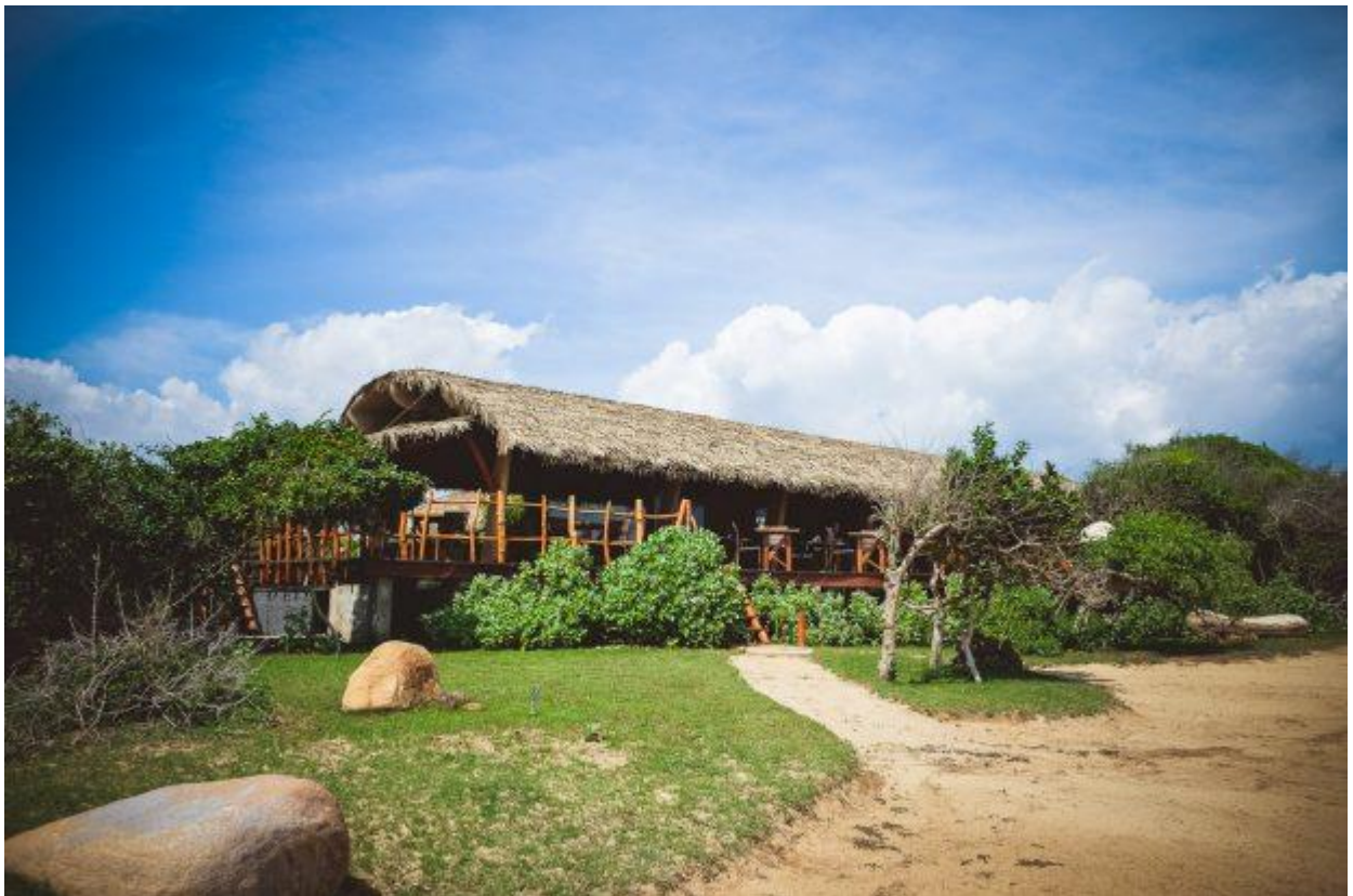
Fruit and vegetables come from a nearby farm and the rice is planted in Ulagalla , another Uga Escapes hotel. It is all very fresh and really healthy!