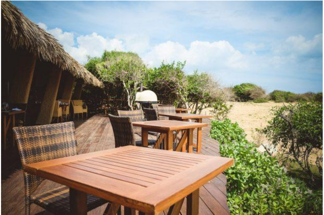
There even is a pizza oven. A highlight for children – they get to bake their own pizza.