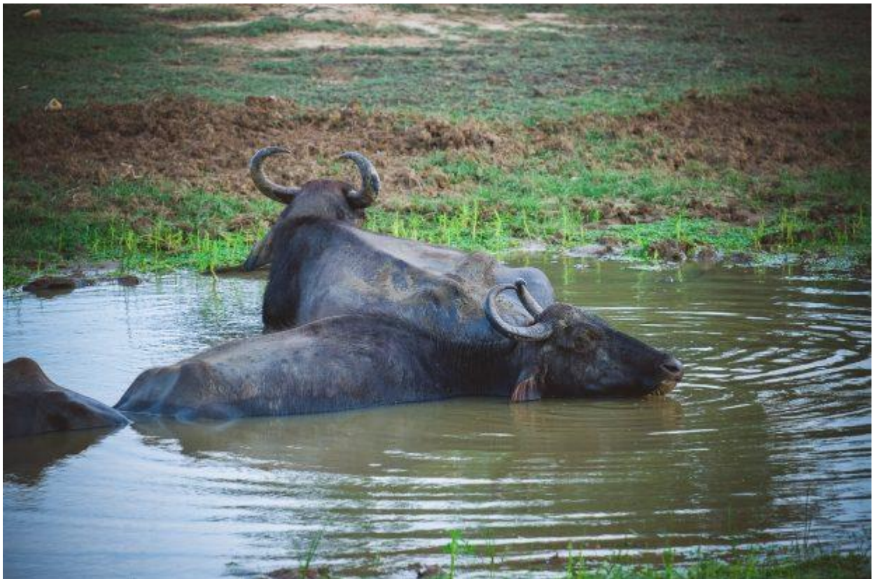
We have never seen so many kingfishers as here in Sri Lanka. They are simply beautiful!