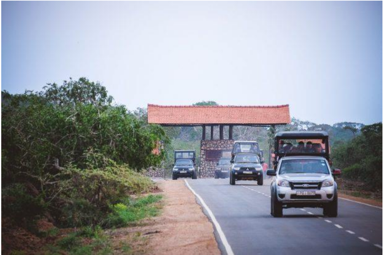
Safaris start in the afternoon or very early in the morning.