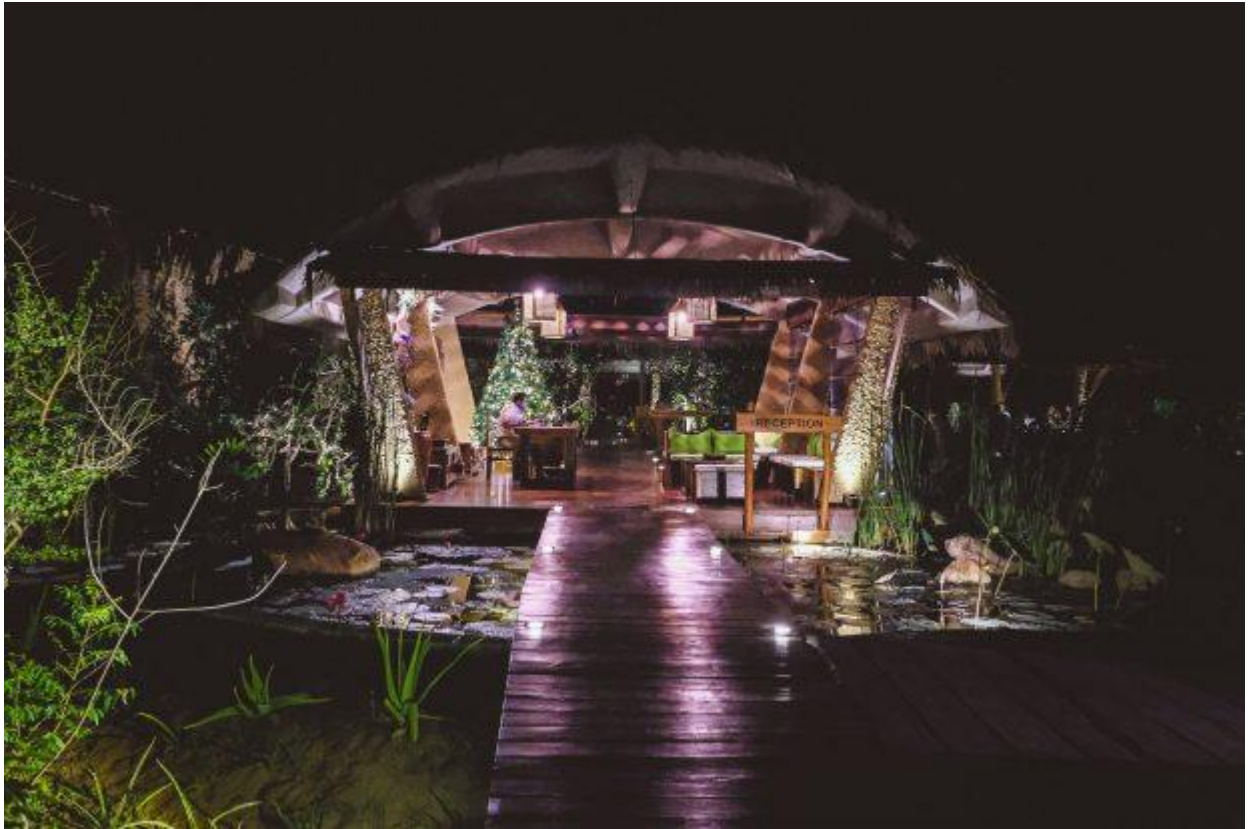
It is so romantic here in the evening!