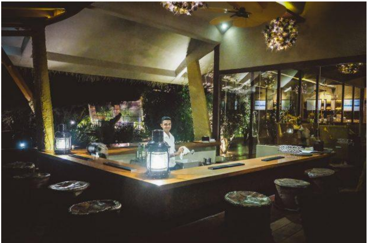
After a great aperitif a delicious 4-course menu is served!