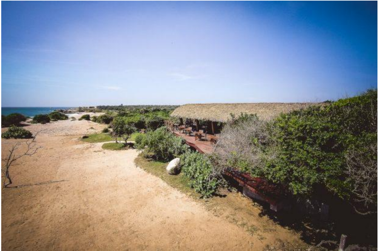
The restaurant is named after the lighthouse, which is very close by.