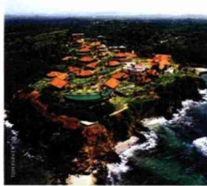
Previous page: Golden Temple in Dambulla. This page, clockwise from top left: Wild Coast Tented Lodge by Yala Hotels; yoga at Tri Sri Lanka; climbing Monkey mountain in Gal Oya; Cape Weligama resort

New bolt-ons worth a look include Premier Holidays' three-night privately escorted tour of Gal Oya National Park and Travel 2's four-day Highlights of Sri Lanka (from £315pp) and six-day