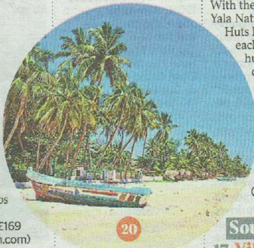
Uppuveli beach near the Jungle Beach resort

Details B&B doubles cost from £157 a night (ugaescapes.com)