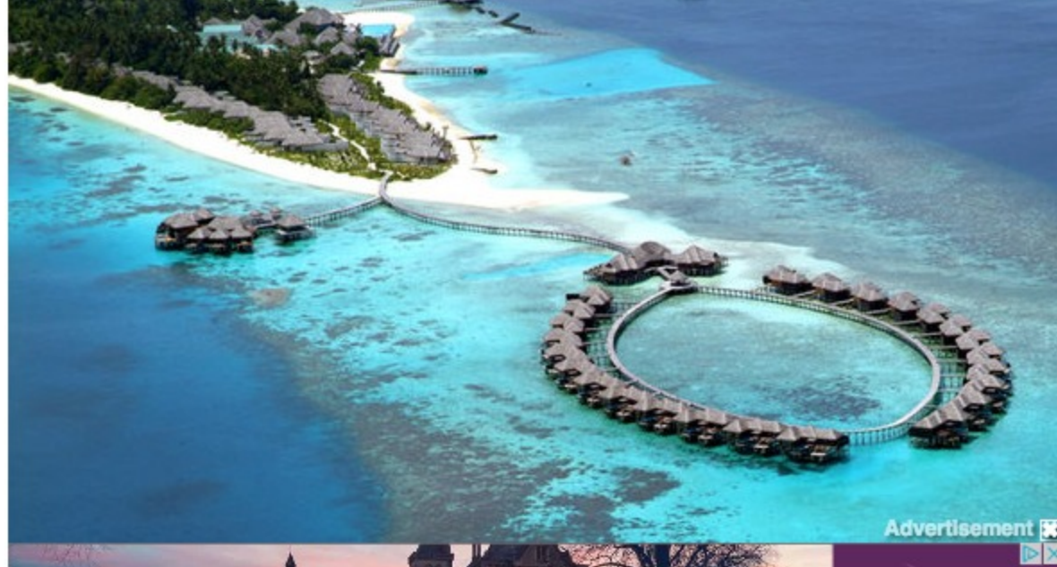
Blue Planet II: The Coco Palm Dhuni Kolhu has a turtle rescue centre on site

Prices on Coco Palm Dhuni Kolhu start from £384 for an Ocean Front Villa.