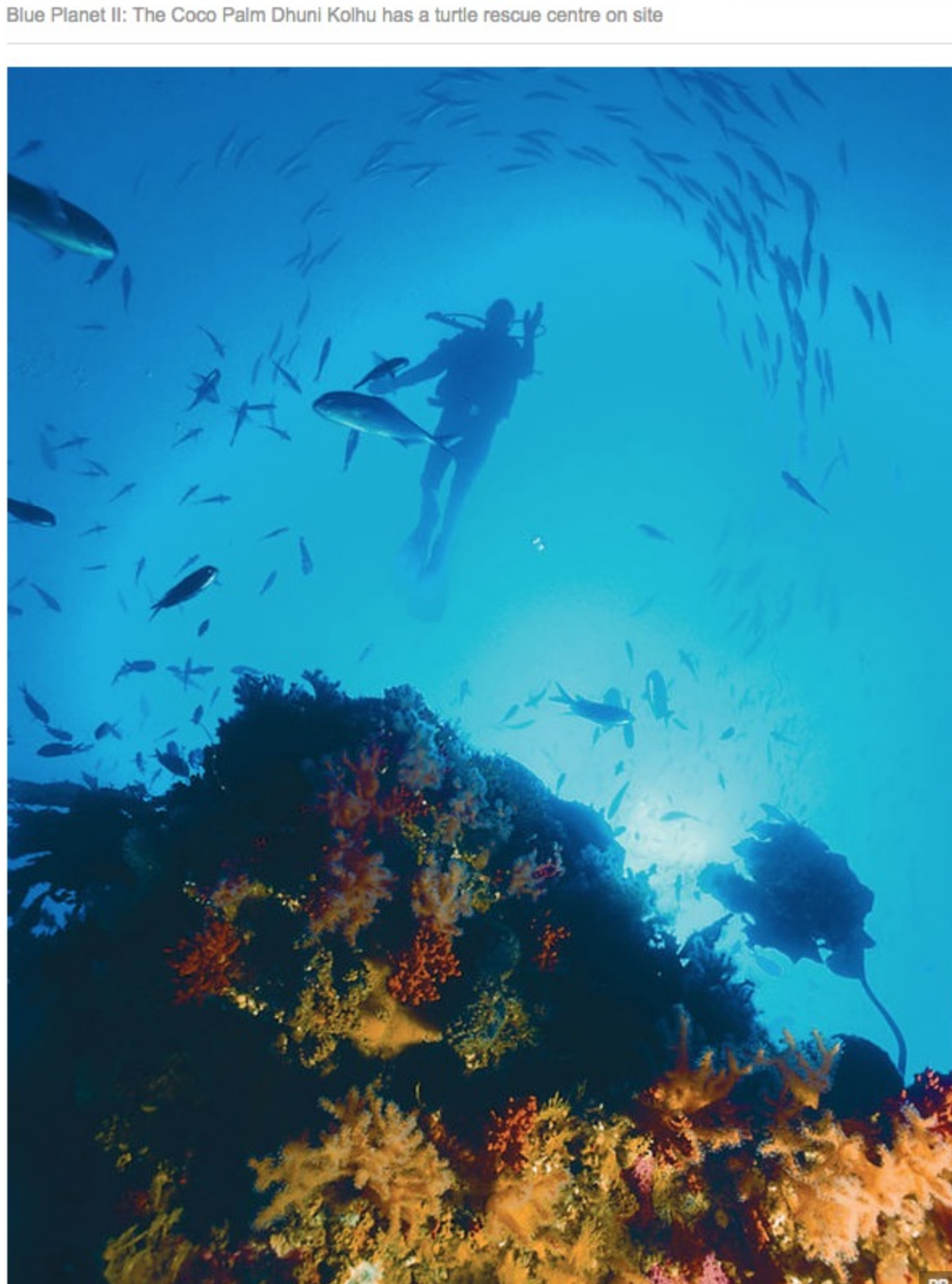
Blue Planet II: Kaikoura, New Zealand, is a top destination for diving