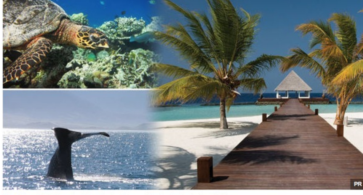
Blue Planet II: These holiday destinations will bring the TV show to life

Since 2012, the resort's resident marine biology team have taken naturally broken pieces of coral and planted them in the inlands' lagoon where the coral can flourish.