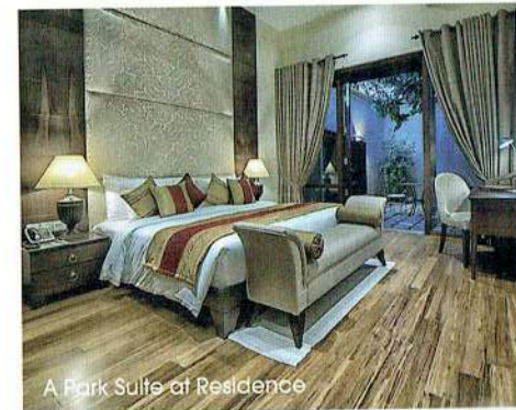
A Park Suite at Residence