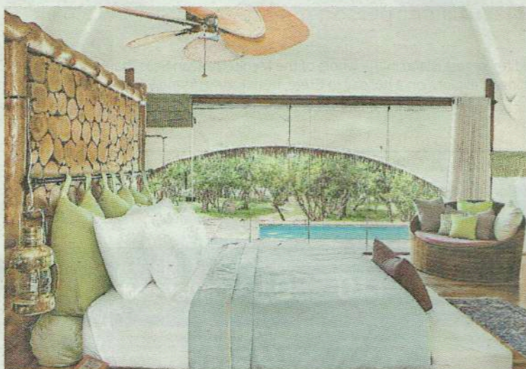
PALATIAL: A room at Chena Huts (6) in Yala National Park, Sri Lanka

Treat yourselves to National Geographic Expeditions' and G Adventures' seven-day Explore Kruger National Park trip, which includes going out with a cheetah researcher from the Carnivore Conservation Programme, part of National Geographic's Big Cats Initiative. From £2,074pp (departing April 10), national-geographic-expeditions.co.uk , 0800 440 2551.