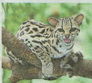
ELUSIVE: A South American margay (18) and the terrace at Chena Huts (6)