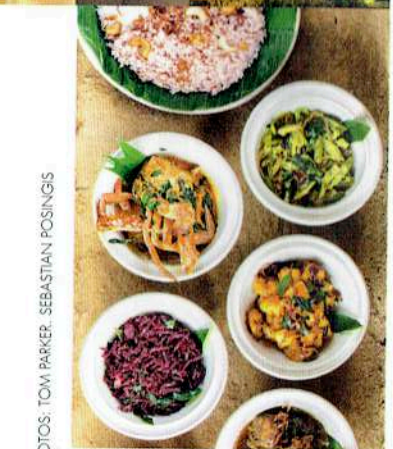
FROM TOP Ocean views at Cape Weligama; HFM shopping editor Laura at Lake Koggala; the hotel's glam entrance; a traditional Sri Lankan dinner