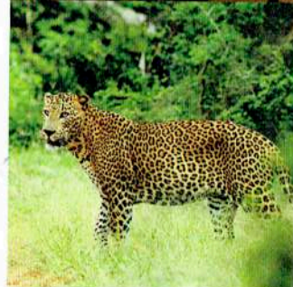
TOP TO BOTTOM Cabins at Chena Huts; overlooking the lagoon at Chena Huts; spotting leopards at Yala National Park